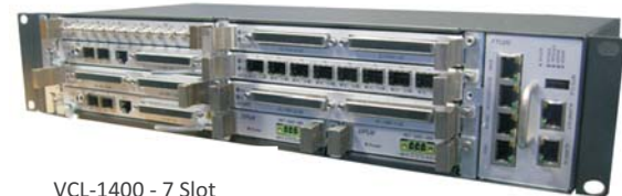
VCL-1400 - 7 Slot